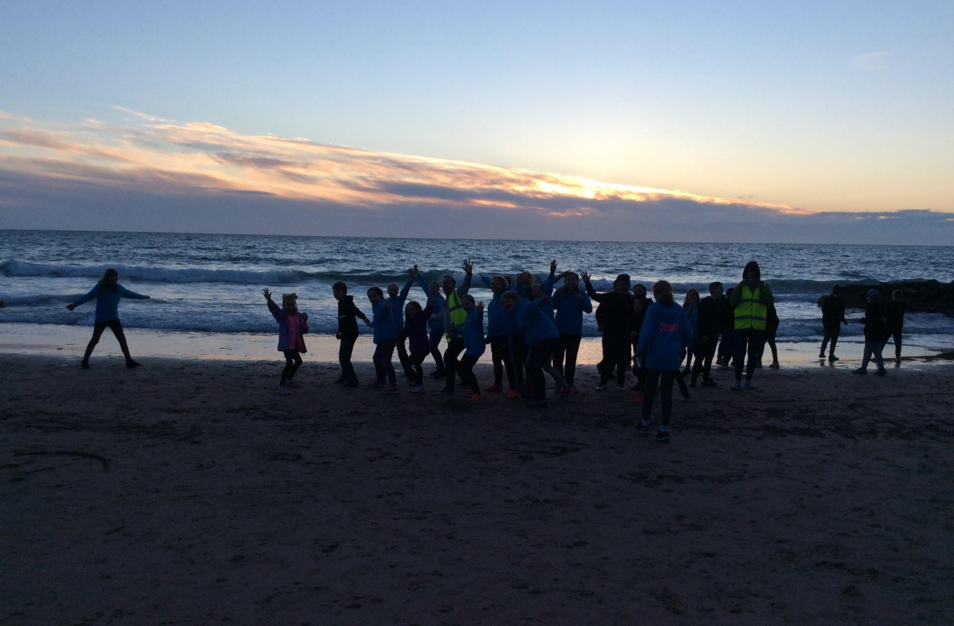
A walk to the beach on Monday night .